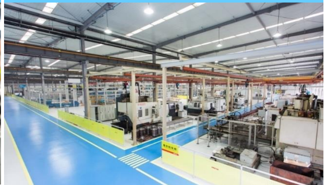
Machine Assembly Line