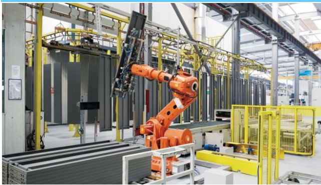
Auto painting line