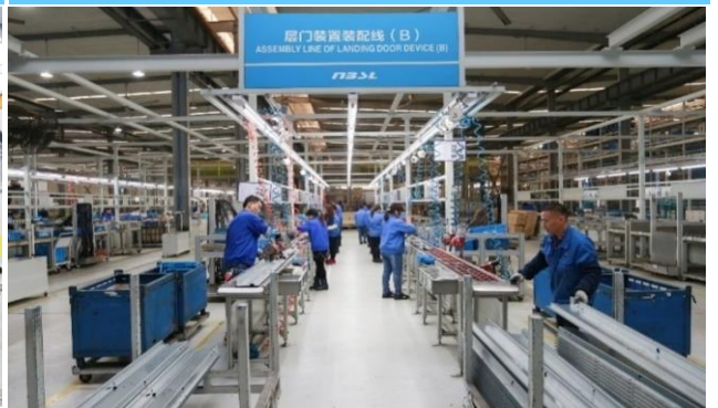
Assembly line for LTT