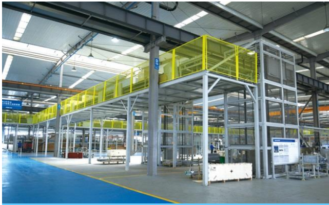
Box transmission line